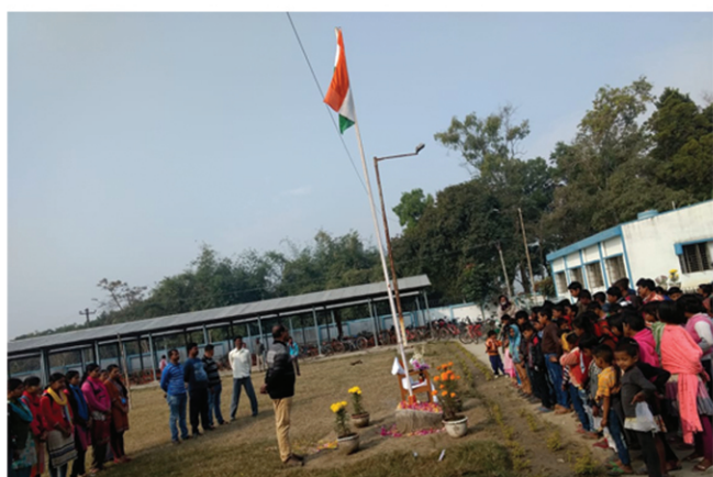
Flag hoisting on Independence Day