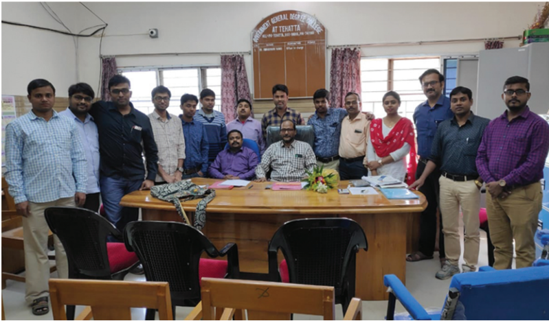
Faculty members of the College