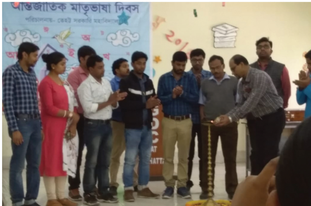
Lighting of Lamp by Officer-in-Charge on the eve of Bhasa Divas