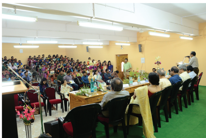
During the national conference organized by the college