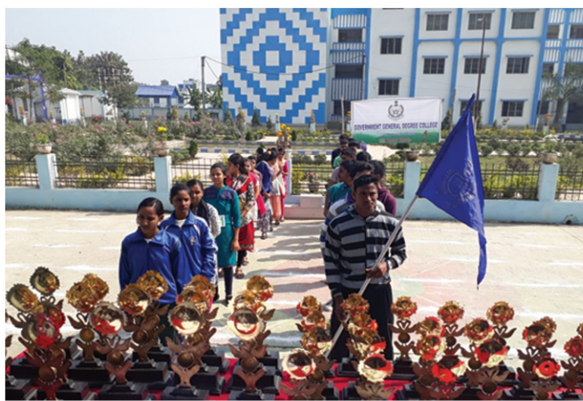
Annual Athletic Meet of the College