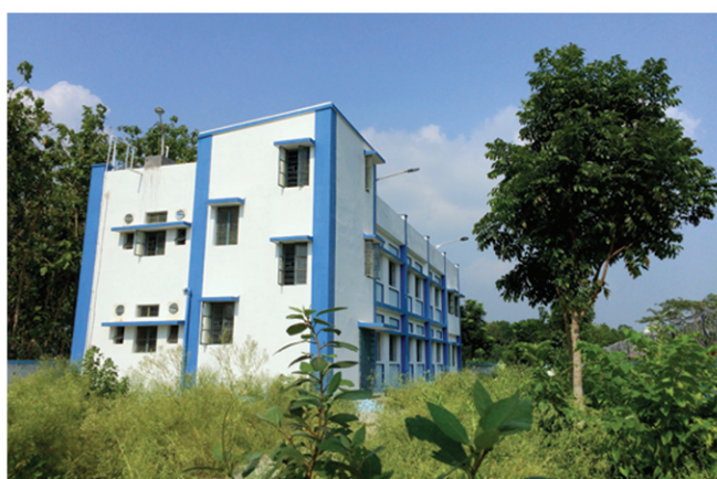
Girls' Hostel (Under Construction)