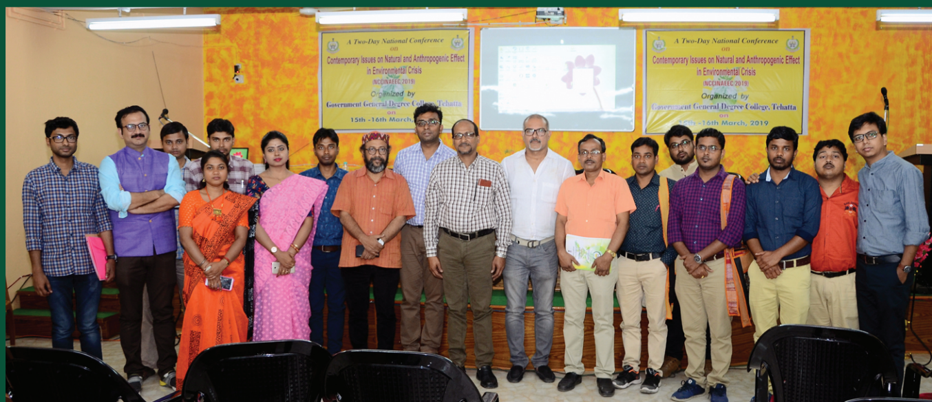
Post-Conference (March, 2019) Photo Session with Teaching Staffs and Resource Persons