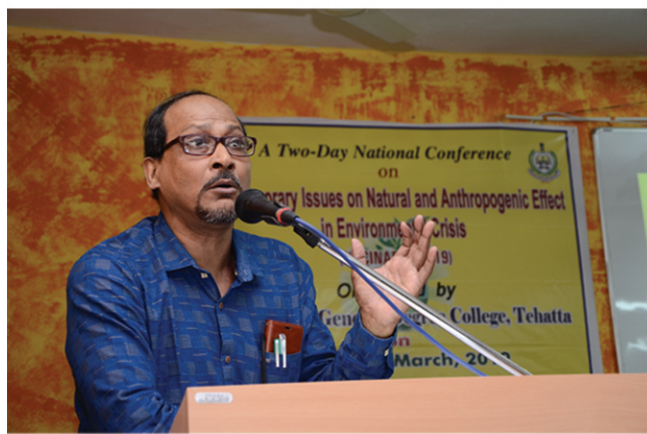
Officer-in-Charge delivering welcome address in the national conference organized by the college