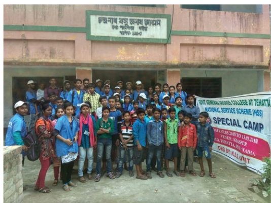
NSS volunteers visiting a local orphanage