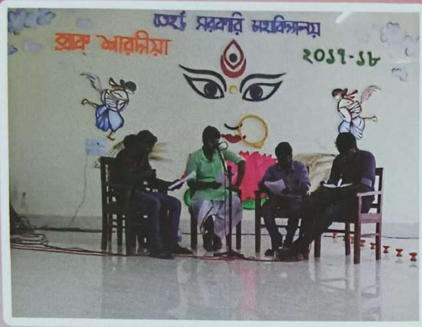
Students performing in the Cultural programme