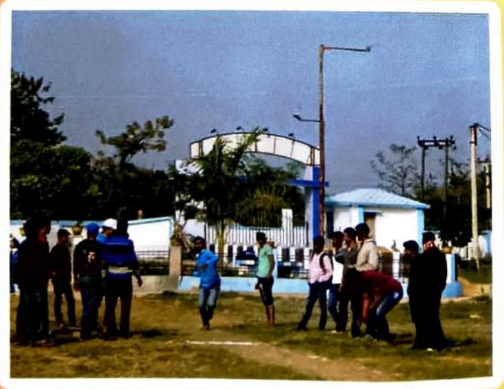
Students activities in annual sports