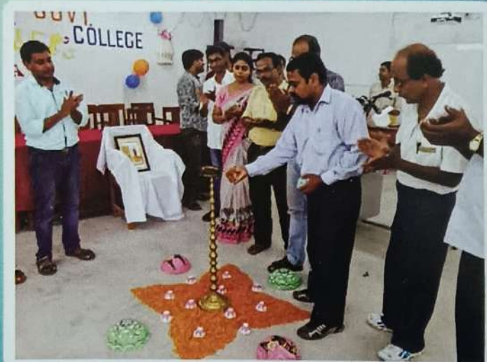
Inauguration of the celebration of Teachers day by Office in charge