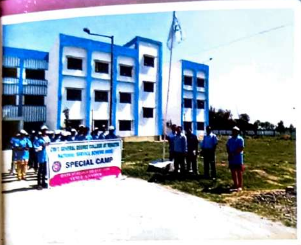
Special Camp by NSS unit